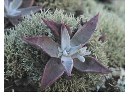
Verity's liveforever ( Dudleya verityi ) growing in the wild in a bed of lichen.

The Springs fire started along Highway 101 and within several hours had burned the entire 5,000-acre area over which the Dudleya populations are dispersed. The fire ultimately burned 24,000 acres over three days. Like almost all fires in the Santa Monica Mountains, it was a man-made fire, started by an automobile. Its occurrence during the spring growth and flowering period, rather than the late summer dormancy period, was unusual.