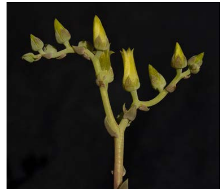
Flowers of Dudleya verityi growing in cultivation at the UCSC Arboretum.