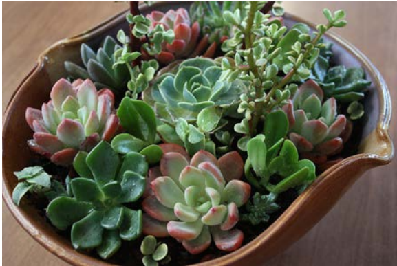
Planting and photo by Suzy Brooks

Our speaker, Jeff Brooks, works at a nursery that grows succulents, some cactus, and ornamental plants. He's been working with soils for many years and was quite ready to share some thoughts on the matter. Like our houses, soil provides a place for growth and support and a place to store our food, water, and air and to use it. And as different people have different shelters, all plants do not want the same 3 bedroom, 2 bath.